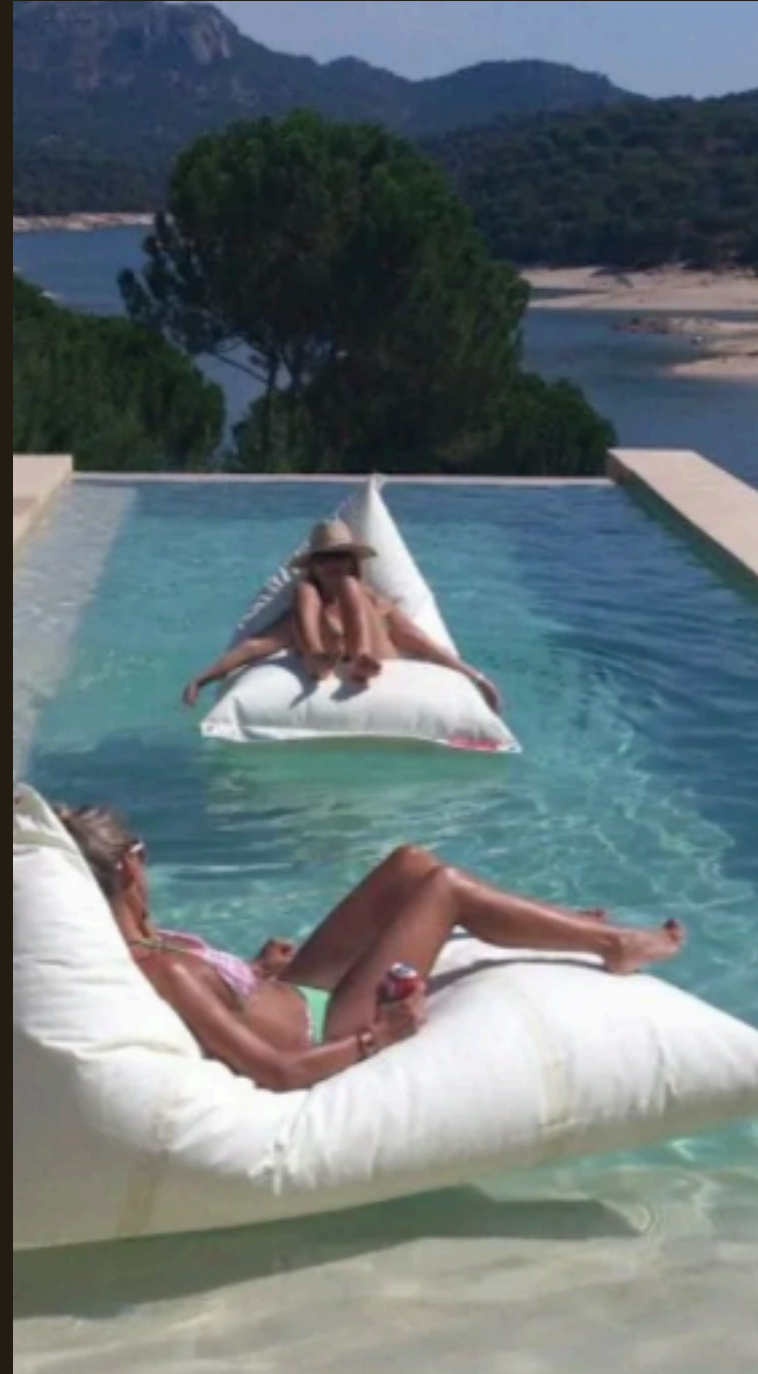
Floating Bean Bag Upcycle Sail