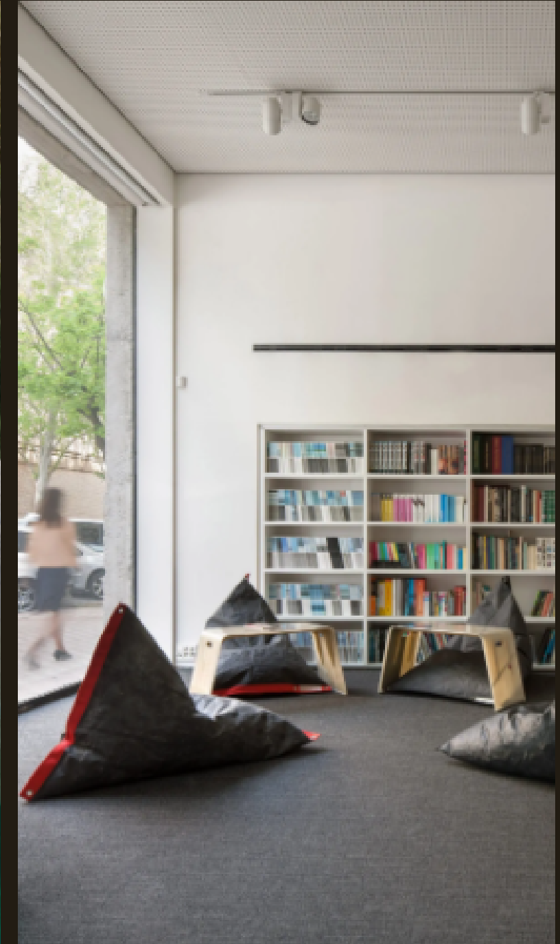
Indoor Outdoor Floating Bean Bag