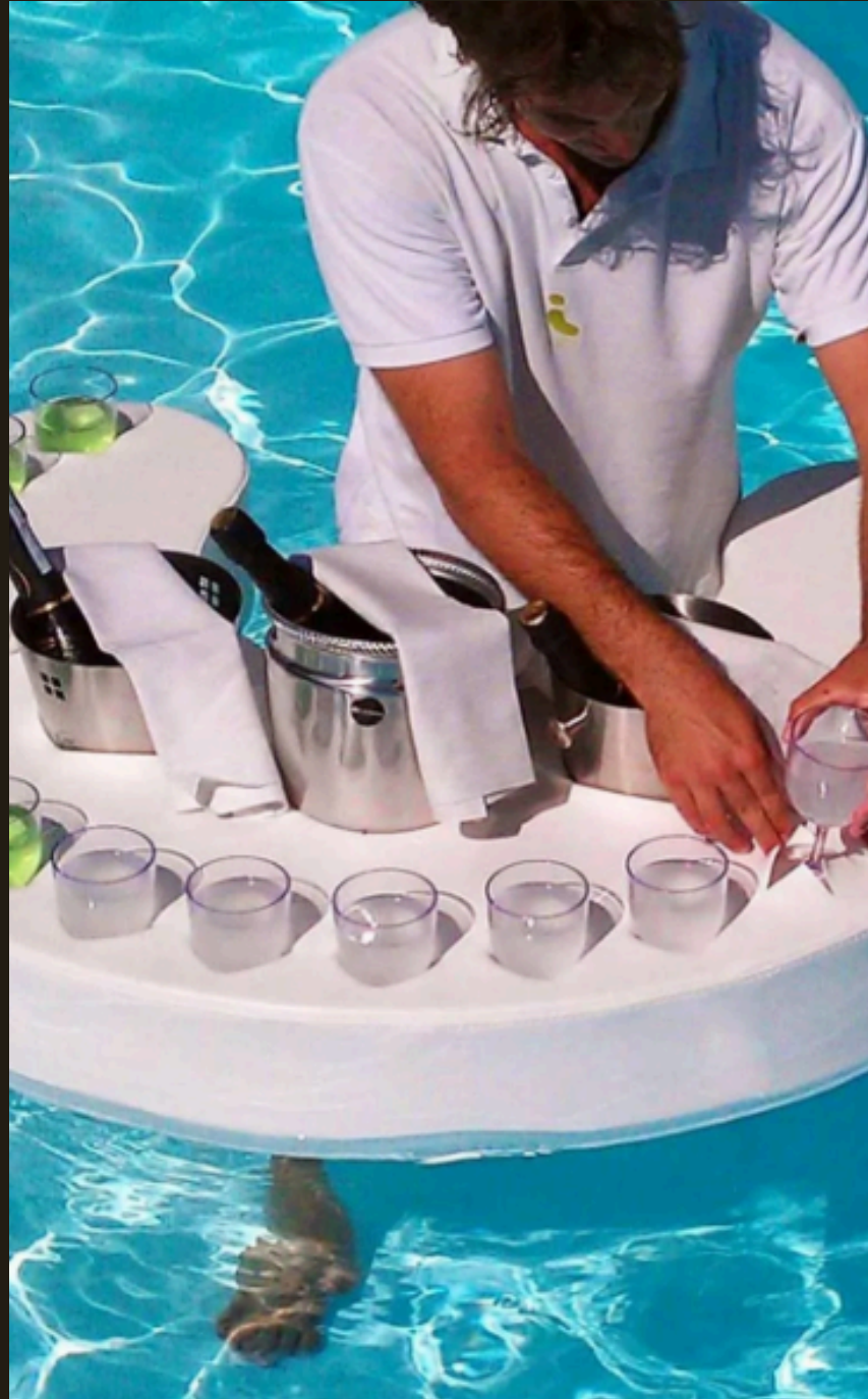
Floating Bar Pool Champagne